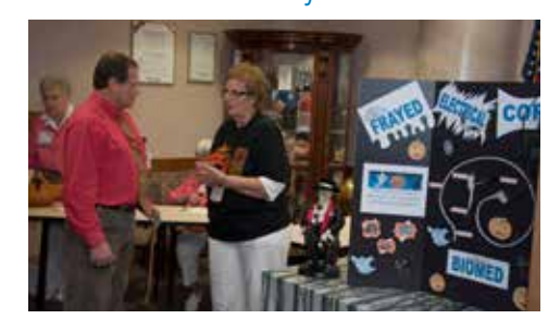
Lima Memorial's Halloween-themed Safety Expo raises awareness of safety issues in an engaging manner.

raise awareness of safety issues—for example, "guess the weight of the laundry bundle."